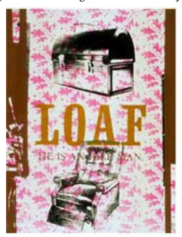
Figure 2. Scott Zukowski's 'Loaf'

through shape and form, align with a loaf of bread (the shape of the tine and someone lying around (the couch). The semantic element is the cultural collaboration - it is clearly of a cultural origin and location - in India or Iraq or Cambodia - the word for lying around and for bread would be quite different and this poster would be meaningless, complying only with English speaking syntactic visual and verbal rules that are semantically recognisable to anyone familiar with the discourse (so people in other cultures, familiar with cultural behaviours would understand the language and verbal signs simultaneously.